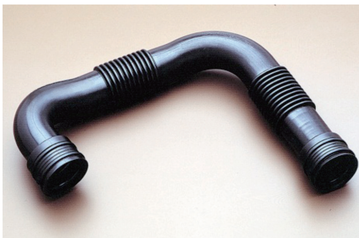
Air ducts made with Hytrel® HTR8888 BK190A offer quiet air management performance.

Quieter EVs and HEVs present acoustic challenges for vehicle designers. Noises that used to be masked by internal combustion engines (ICEs) must now be dampened or eliminated to create a better driving experience. Manufacturers who use DuPont™ Hytrel® HTR8888 BK190A for vehicle air management can differentiate their vehicles with significantly less NVH (Noise Vibration Harshness).