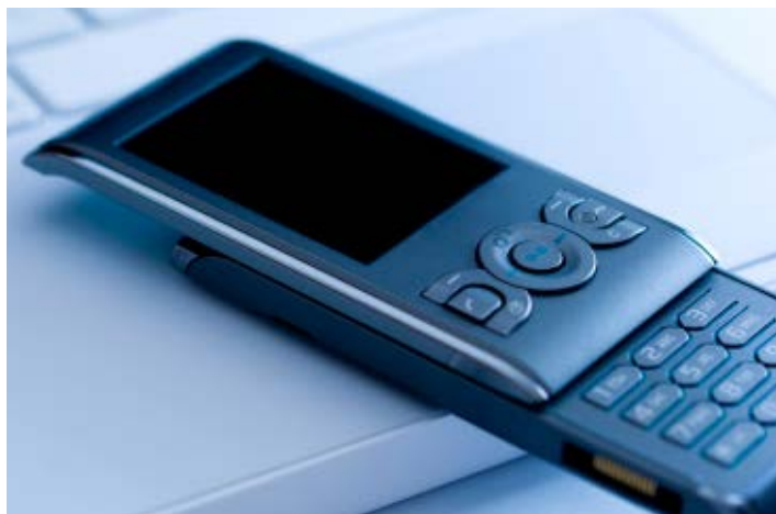
Phone shown does not use SMK battery connector.